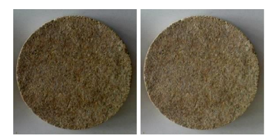
Figure 2. Resulted in composite structure

The form of test material made is adjusted to the size required by the tester, ie the impedance tube. The form used is a cylinder or disc, with a diameter of 8 cm, for its thickness in accordance with the thickness used, which is equal to 1 cm. The result is silenced in the mold for 1 day. After that, just released from the mold by ensuring the glue has dried and adhered well, as in figure 2.