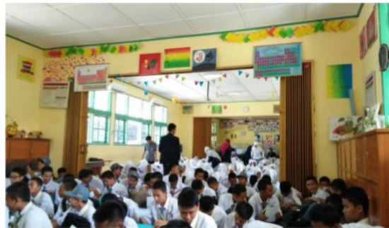
Figure 3. Arabic Camp Activity Procedure

Arabic Camp activities can be seen in the following procedure.