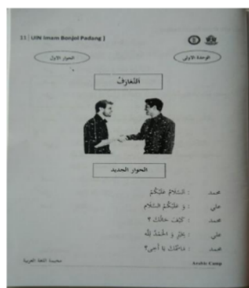
Figure 4. Learning Module

The tutors provide learning at the beginning of the meeting, then Arabic production practice is carried out after students receive material that has been arranged through modules. The Arabic learning process after Arabic Camp should be followed up as well as efforts to develop student skills and develop effective modules. One of the modules implemented is as follows.