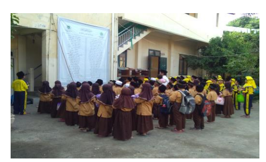
Figure 1. Reading the Asmaul Husna

MI Nurul Ummah Kotagede initiated learning that internalized the Qur'ani values in the mind (memory), attitude, and behavior of students. Of course, by prioritizing the development of superior programs in the form of tahsin, tahfidh al-Qur'an, plus other worship activities. The routine activities at MI Nurul Ummah begin with the reading of the Asmaul Husna, in which this activity is carried out in the madrasa field by facing a wall that is emblazoned with the inscription of the Prophet to be read simultaneously by students and guided by the teacher (See Figure 1).