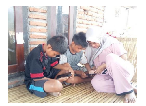
Figure 3. Students using social media under parental guidance

Social media can facilitate students' participation in social and constructive activities, enabling them to engage with peers, share interests and accomplishments, and contribute to