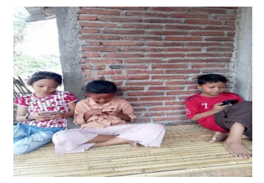
Figure 2. Students using social media independently

Consistent with the interview above, the interview conducted by Japar (2024); Matanari et al. (2020) also supports this, revealed that teachers play a crucial role in shaping students' character through education, as instilling character values in children is a process that takes time. This aligns with interviews with several parents of sixth-grade students regarding addressing the negative impacts of social media on students' character. Parents can actively engage in their children's online activities and learning, educate them about the impact of social media, online ethics, and privacy, and establish rules for screen time and content, with consequences for rule violations. While social media can offer benefits to elementary school children, its proper use should be supervised by both teachers and parents, as depicted in Figures 2 and 3 below: