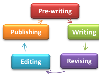
Figure 1. An example writing process in PBI-A First semester