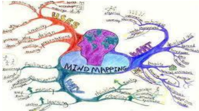
Image 1.1 mind mapping

students order and structures their thinking through maps. Concept of mind mapping based on how the brain saves the information branches in thought, it is look likes branch of tree. Here is image of mind mapping in the brain: