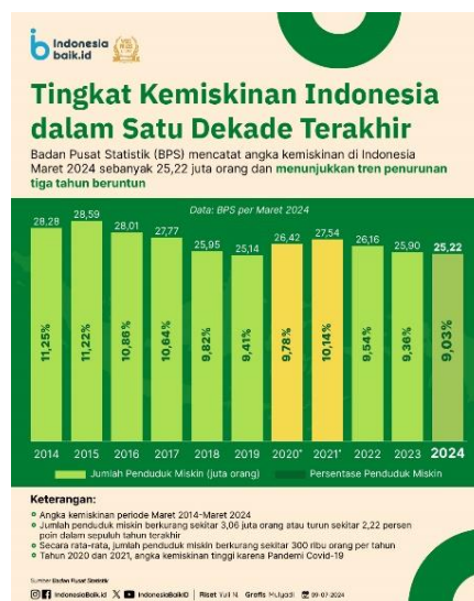
Figure 1. Indonesia's Poverty Level in the Last Decade

Reflecting on the purpose of zakat management in the law, it is in line with the poverty rate in Indonesia which is still very high. Based on data from the Central Statistics Agency (BPS) in March 2024, the poverty rate in Indonesia is at 9.36% (Public Relations, 2024). When compared to the 2020-2024 National Medium-Term Development Plan (RPJMN) which targets the poverty rate to be 6.5-7.5%, of course, the figure of 9.36% is still quite large and has a difference of 1.86% that must be pursued to achieve the target. The figure of 1.86% when viewed is not too large, but when compared to the fluctuations in the poverty rate in 1 decade of 2014 – 2024 as shown in figure 1 below which only ranges from 0.3 – 0.5% per year, the figure of 1.86% is relatively large and difficult to achieve until the end of the 2024 period (EP/SK-BPMI, 2024).