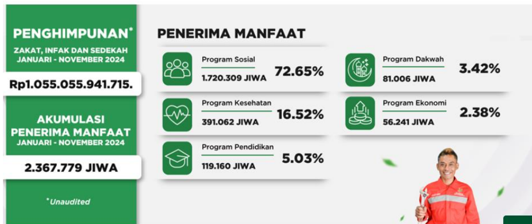
Figure 2. Data on Collection and Beneficiaries of Zakat, Infaq, and Alms for the Period of January – November 2024 (BAZNAS, 2024)

instruments of infaq and shadaqah which are voluntary gifts that cannot be estimated with certainty how much potential they have. Of all these potentials, only IDR 1,055,055,941,715 or equivalent to 0.32% of the total potential with an accumulation of 2,367,799 beneficiaries during the period of January – November 2024. When a number of beneficiaries are described based on program categories as shown in figure 2 below, it can be seen that 72.65% are in the form of social programs, 16.52% are health programs, 5.03% are educational programs, 3.42% are da'wah programs, and 2.38% are economic programs (BAZNAS, 2024).