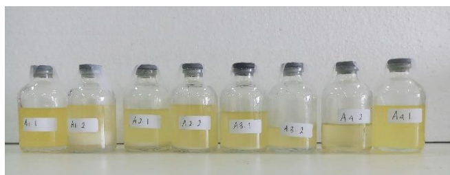
Figure 2. Biodiesel from vegetable oil

Biodiesel from synthesis had a clear yellow colour. All biodiesel produced by synthesis had a colour similarity, as shown in Figure 2. Biodiesel is yellow, which often changes into brown because of storage time (Ferrari et al., 2011).