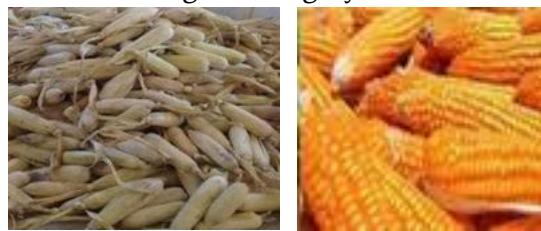
Figure 1. Old corn with good category (Budiono, 2020, Taneo & Madu, 2022)

In the corn selection process, the corn selected is a local variety of corn that is old, smooth, and not damaged at all by pests and diseases, to obtain milling results in the form of quality corn flour (Lalujan et al., 2017). After being selected, the corn is then peeled and cleaned from the corn hairs that are attached. Corn with a good category can be seen in Figure 1.