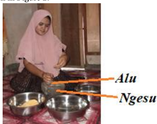
Figure 2. Process of pounding corn and peanuts using ngesu and alu

The process of grinding corn and peanuts can be done using traditional and modern methods. The traditional method used by people in the Ende district is the ngesu mash tradition. The ngesu pounding tradition consists of tools in the form of a ngesu and a alu . Alu is a round stick made of carved river stone or wood and used to pound corn and beans in ngesu which is also made of river stone or large wood. In the middle of the top end of the river stone or large wood to be made into ngesu , a hole is made and the inside is thrown away. Making a hole in ngesu is done by chiseling it as deep as desired, and usually, the depth of the ngesu hole is measured from the tip of the finger to the wrist (Primamona, 2020). The process of pounding corn and peanuts using a ngesu and alu in making Wu'u can be seen in Figure 2.