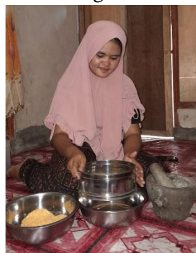
Figure 4. Process of sifting corn flour and peanuts

The corn and peanuts that have been ground in the previous process are then sieved to separate the mixture based on the dimensions and particle size. During sieving, the position of the corn and peanuts that are still left on the sieve is coarse corn and peanuts with large particle sizes, while the flowing sieve results are fine flour that has a small particle size (Yokasing et al., 2022). The results of the sieve with a small particle size will be used in making Wu'u , while the coarse corn and peanuts will undergo a refining and sieving process repeatedly until the same particle size is obtained as corn flour or peanut flour. The picture of the corn and peanut flour sieving process in making Wu'u is presented in Figure 4.