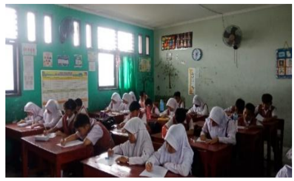
Figure 1. Pretest Documentation

The collaborative teaching method, also known as TGT, is considered interesting, efficient, and involves students in diverse groups (Amni & Kusuma Ningrat, 2021). According to research conducted in January 2025 at Public Elementary School Teluk Pucung III in Bekasi City, the significant impact of implementing the TGT type cooperative learning model was identified.