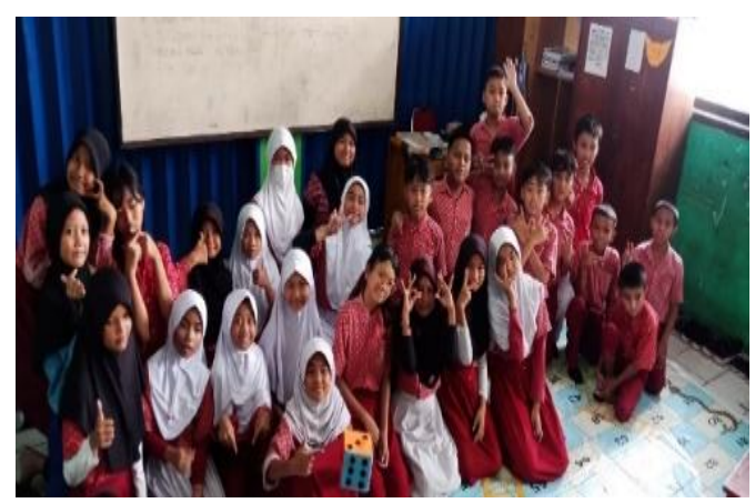
Figure 2. Treatment Documentation

In the first stage before being treated, students are expected to fill out the pretest questions first to see the students' initial abilities. After the pretest there are 6 students or only 20% who have reached the KKM in social studies lessons, while 24 students or 80% or have not reached the KKM out of a total of 30 students in class V.