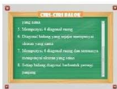
1.12 Ciri Balok

In this section, the material is presented on the characteristics of cubes and blocks along with examples of their nets. Each slide is equipped with next, previous, home and exit buttons, each of which is explained on the slide of the button function.