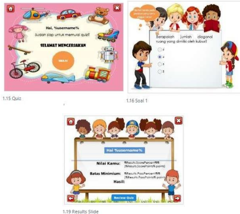
Figure 3. Quiz Display

In this section there is an introductory quiz display that can be clicked on the Start button. Next, students will start taking quizzes on the material that has been studied. There are 3 quizzes in the form of choices, students can choose the right answer in the small circle next to the answer. After completing all three quizzes, students can see the results on the final slide of the quiz.