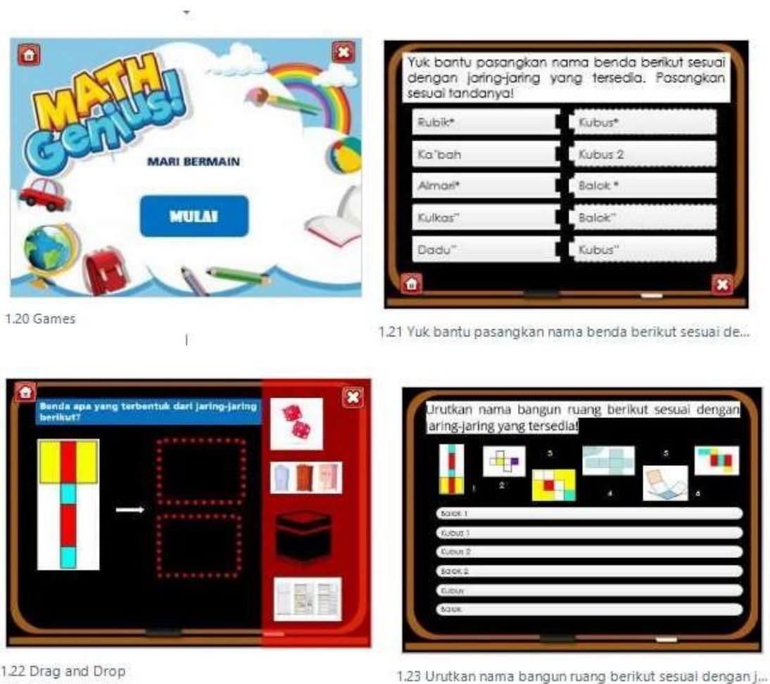
Figure 4. Games Display