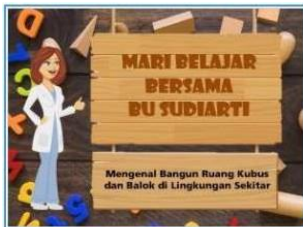
1.1 Halaman Awal